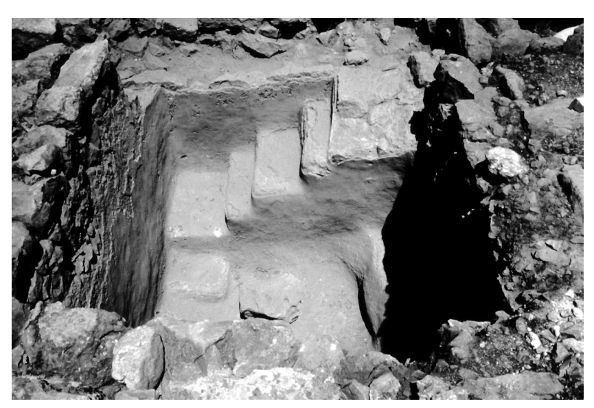
Figure B. Mikveh at Qeren Naftali.

attack in around 160 BCE. Rather, it probably happened much later, during the expansion of the Hasmonean kingdom, whether at the time of Hyrcanus I after his father's campaign against Beth She'an, during the one-year reign of Aristobulus, as many scholars suggest, or during the days of Jannaeus himself. Josephus tells us that Hyrcanus I sent young Jannaeus to be raised in the Galilee, and, if this story is true, the Galilee was taken during the days of his father.