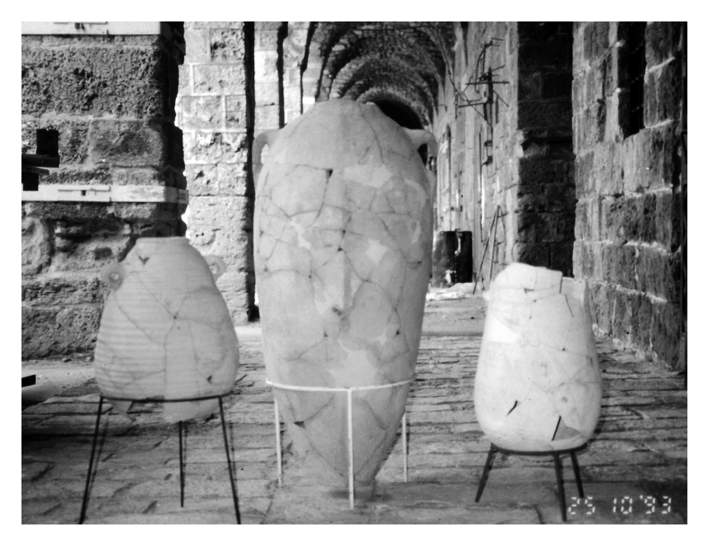
Figure E. GCW jar in the center with with two typical Hellenistic jars on either side.

In two different areas of the excavations at Yodefat, we discovered below the later Early Roman period a layer from the Hellenistic period. On the hill's northern side, this layer was found beneath the Hasmonean wall that encircled the summit. On the floor of this room we found two GCW pithoi together with an imported wine jar with a stamped handle that was dated to the beginning of the second half of the second century BCE.<sup>11</sup>