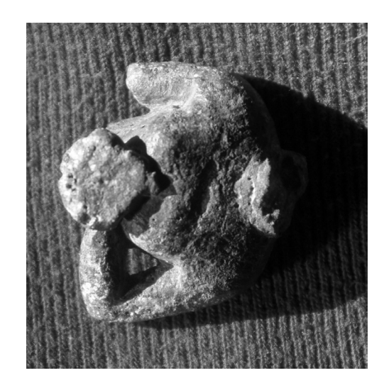
Figure D. A figurine from Beer Sheba. Photo by Mordechai Aviam. Used by permission.