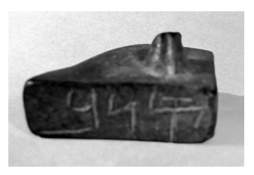
Figure C. The base of the Apis figurine found at Beer Sheba of the Galilee. Photo by Mordechai Aviam. Used by permission.